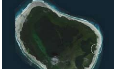
Location of the landing/campsite on Clipperton Island.

The skipper made a tactical decision and selected a very handsome grove of trees, announcing that they would take some boxes ashore. Quickly, I selected the containers with emergency food, lights, radios, medical supplies and a small generator. The Zodiac was away and our spirits soared. But soon they returned with bad news: no more boxes or people, it was too rough. The