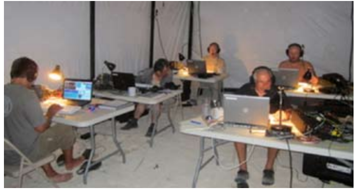
One of the operating tents — from the outside and filled with operators inside.

established a kind of corporation yard: the various shipping cases and gasoline jerry cans were arrayed in rows, providing a kind of open-air warehouse. Most of the team members were busy completing the two radio operation tents, designated Site A (SSB operation) and Site B (CW). Even the sleeping tents had been erected and populated by cots, air mattresses, blankets and pillows. I took the last one, and posted my callsign on the doorway.