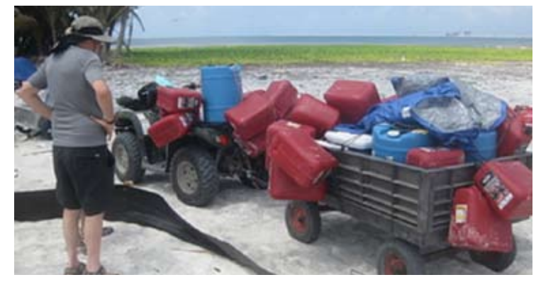
Northern California DX Foundation Newsletter

Wading into the lagoon, I placed the hose with its intake filter in a sub-