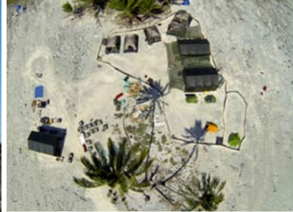
Aerial photo of the TX5K campsite.