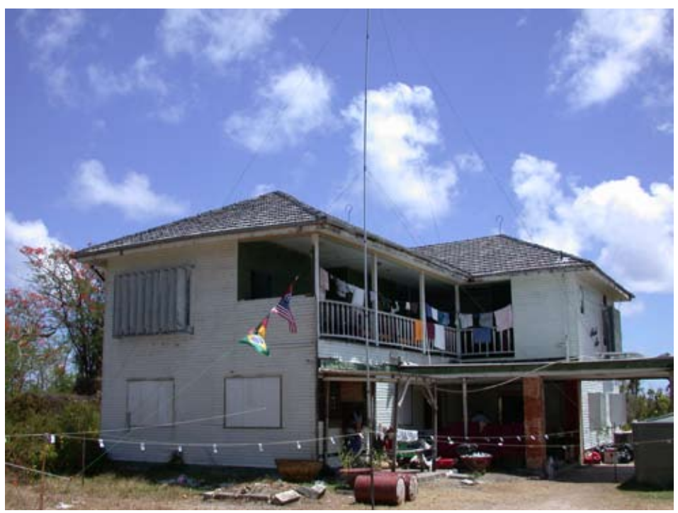
Banaba House, our .333-star rated home-away-from-home.

(Banaba). The International Date Line is bent to the east of this island nation so though they share the same day, they span four time zones. This gerrymandering of the International Date Line causes an anomaly in our world clocks. By definition a day is 24 hours in length, but the Line Island Time Zone is actually 14 hours ahead of UTC, giving us days that are 26 hours from the eastern most time zone to the western most time zone. Banaba, itself, has its own time zone that places local time 30 minutes behind the Gilbert Island Time Zone (Tarawa).