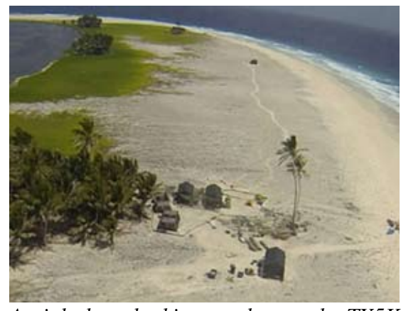
Aerial photo looking north over the TX5K campsite.

By the end of the morning every load of cargo and every other team member was on the island, so I took