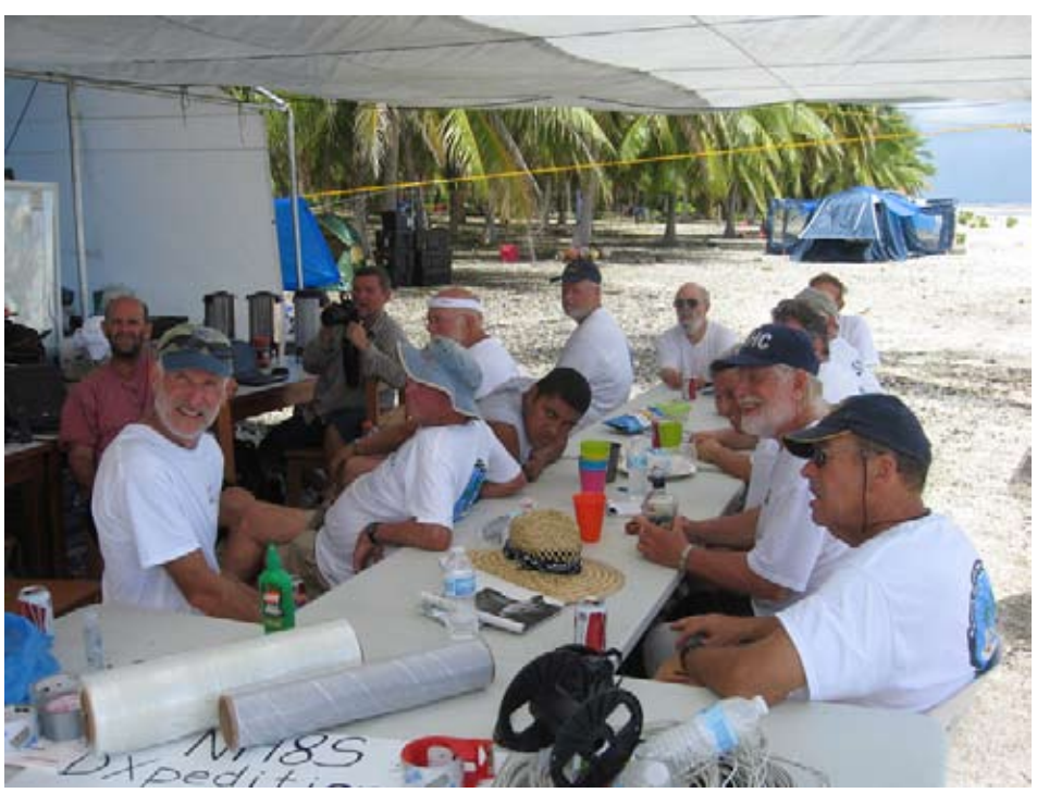
Just hanging out between shifts.

QSLing is an important and tedious job. Joe4, AA4NN, volunteered to respond to the paper QSLs, but we wanted to use technology as much as possible to simplify the whole process. We examined several systems and Clublog was chosen for its robust features — simple uploading, embed-