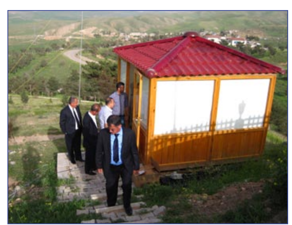
Representatives from the KRG (Kurdistan Regional Governemt) visit our SSB shack to learn about Amateur Radio and see it in operation. This is the first time that Amateur Radio operations were conducted from Kurdistan.

We assured the Ministry that our gear would only travel from the airport to the hotel and back, remaining in our possession the entire time. The Ministry asked for $2,000 in cash to secure an agreement that we would