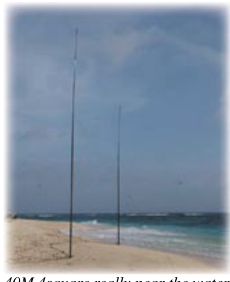
40M 4square really near the water.

We thank all the stations on the other side of the pileups for their cooperation and understanding. We also thank all the many people, companies and DX organizations for their financial assistance and hardware support, without which this DXpedition certainly would not have taken place: Northern California DX Foundation, Lake Wettern DX Group, EUDXF, GDXF, CDXC, INDEXA, DDXG, SDXF, CDXC, INDEXA, DDXG, SDXF, CDXC, GMDXG, VERON, LSDXA, MHDXA, CVCC, TCDXA and MDXA as well as Spiderbeam, microHAM, Titanex and appello.