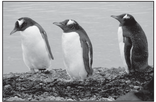
Gentoo penguins gathered near the base of one of our antennas.

ed. As a result, we only became QRV at 0700 UTC on 20 March, and had to go QRT on the morning of 31 March,