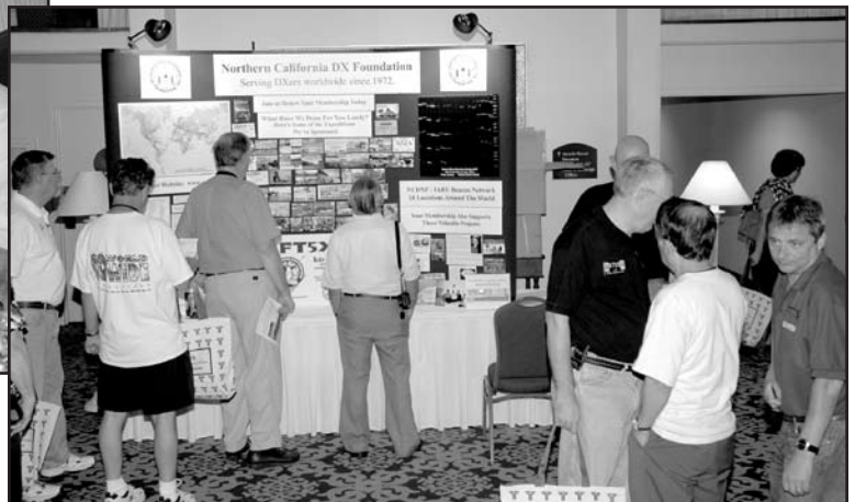
Visitors at the NCDXF booth.