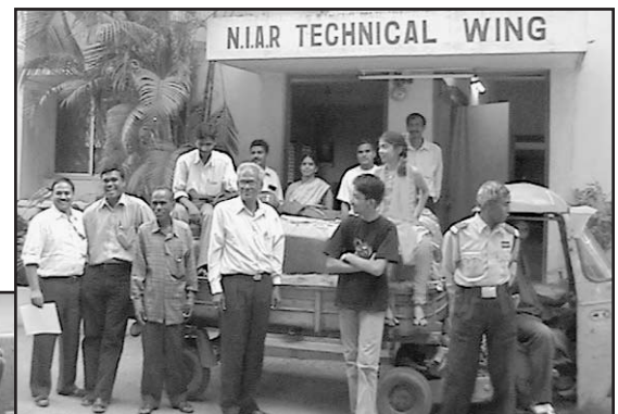
The expedition team just before leaving NIAR in Hyderabad with 660 kilos of equipment (left).