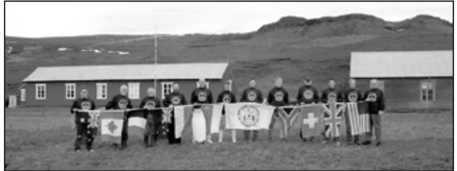
The FT5XO team. (from left) VK6DXI, VE3EJ, W3WL, SP5XVY, N6MZ, 9V1YC, GIØNWG, W7EW, HB9ASZ, MØDXR, NØTT and AG9A.

We arrived safely at Kerguelen on 19 March after smooth sailing for just